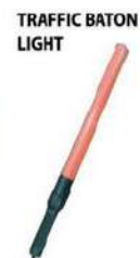
TRAFFIC BATON LIGHT

Dimension: 1000 X 500 X 800 mm 2220 X 520 X 1000 mm Dimension: 1230 X 130 X 1140 mm Material: MDPE Colour: Red, White, Orange