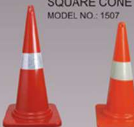
SQUARE CONE MODEL NO.: 1507