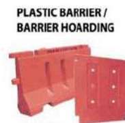
PLASTIC BARRIER / BARRIER HOARDING

Dimension: 290 X 290 X 455 mm / 390 X 390 X 770 mm 440 X 440 X 750 mm / 510 X 510 X 1020 mm Material: LDPE, PVC