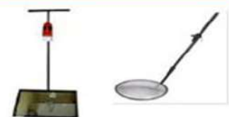
UNDER VEHICLE SEARCH MIRROR