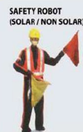
SAFETY ROBOT (SOLAR / NON SOLAR)