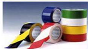
LANE MAREKING TAPE