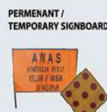
PERMANENT / TEMPORARY SIGNBOARD